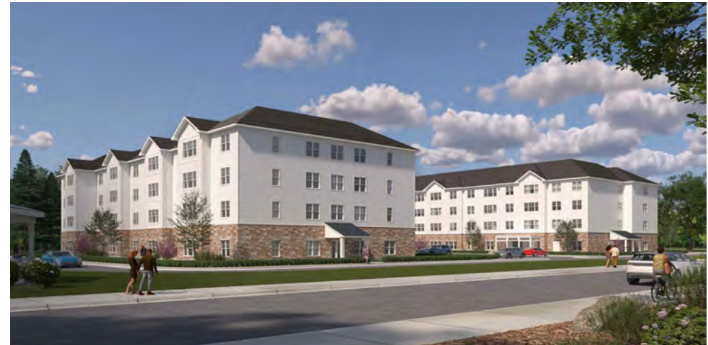
Wellspring – 72 units PSH for recovery