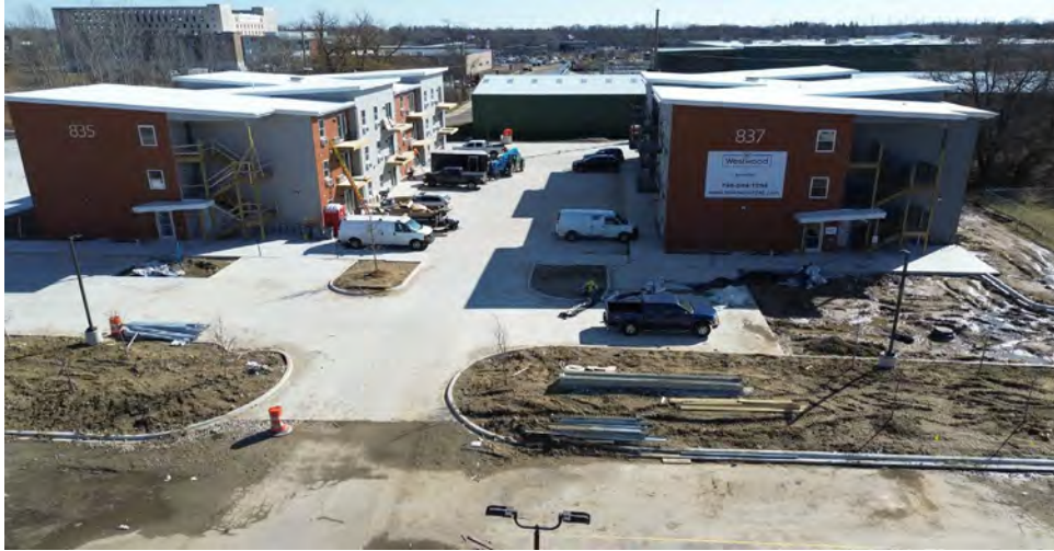
Westwood South – 72 units / 18 PBVs