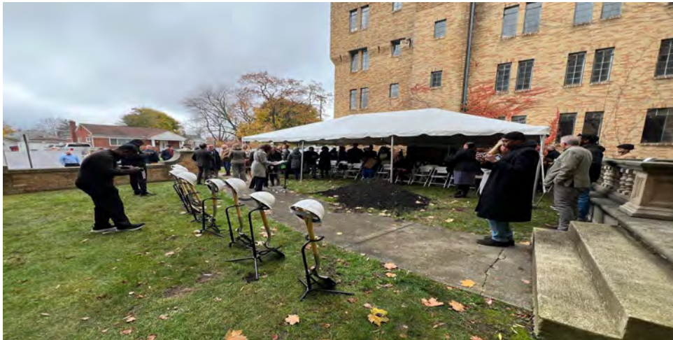
111 Oneida – 50 Units Workforce