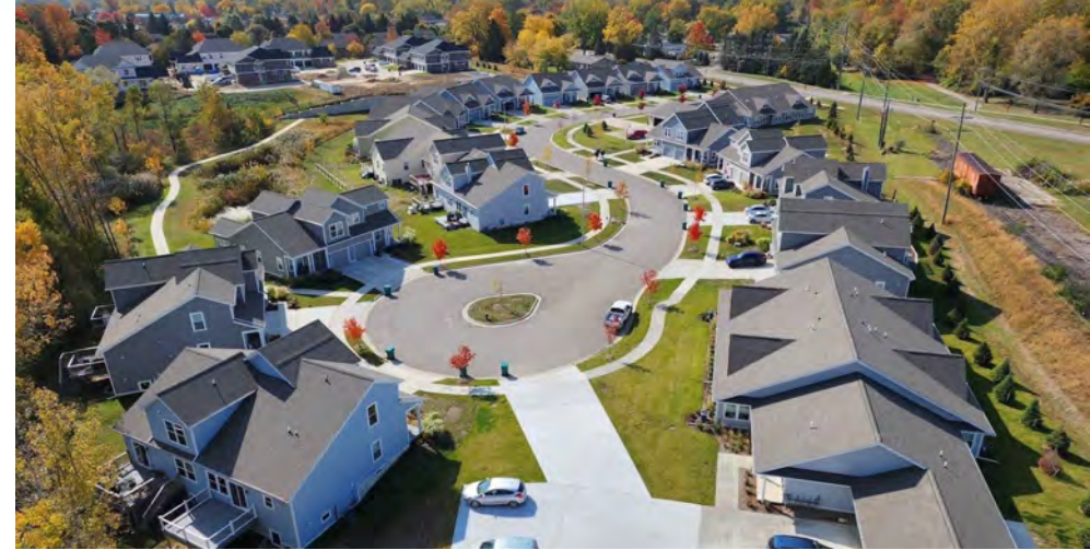
Auburn & Walton Oaks – For-Sale I/DD