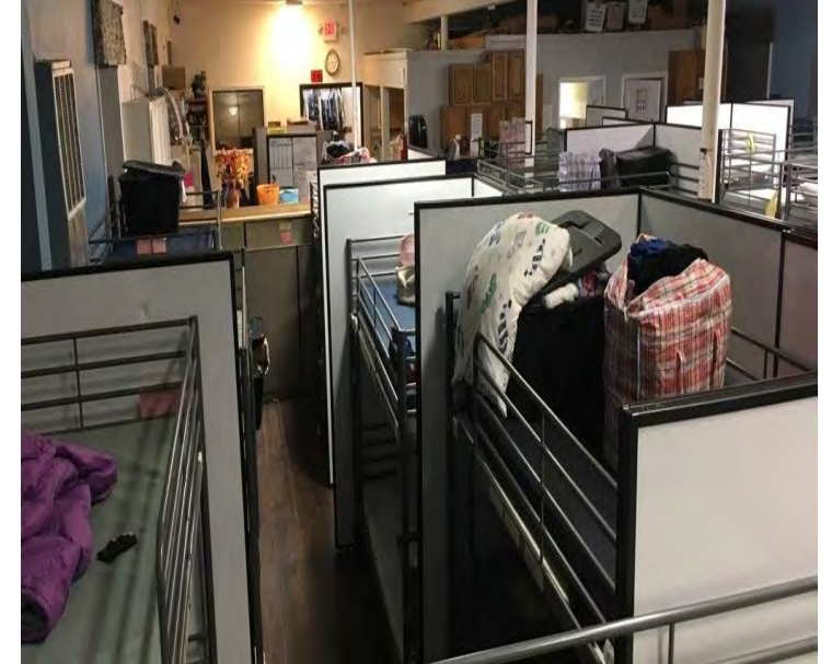
HOPE Shelters, Pontiac