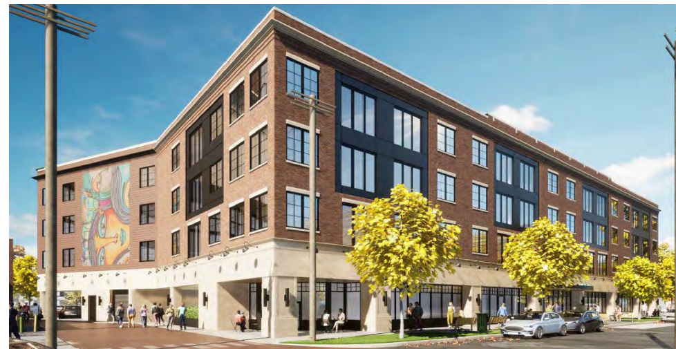
Vester Flats – 72 units mixed-income