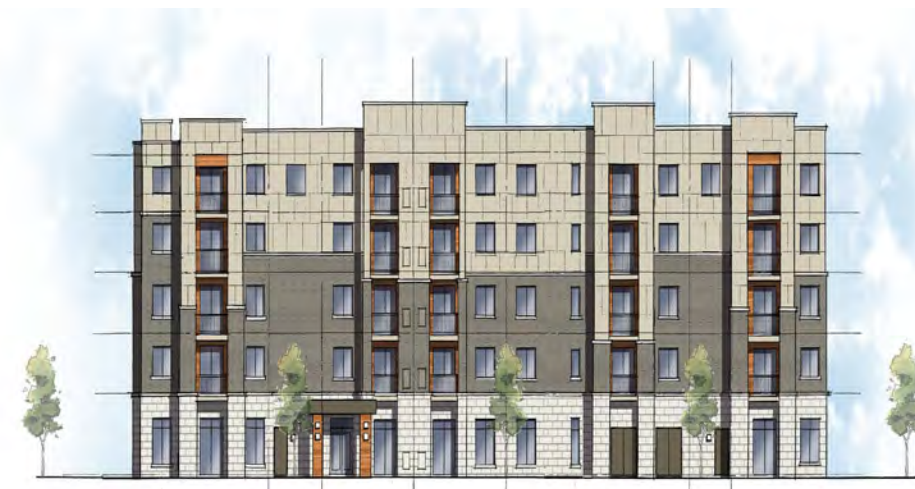
Auburn Place – 54 units of PHS