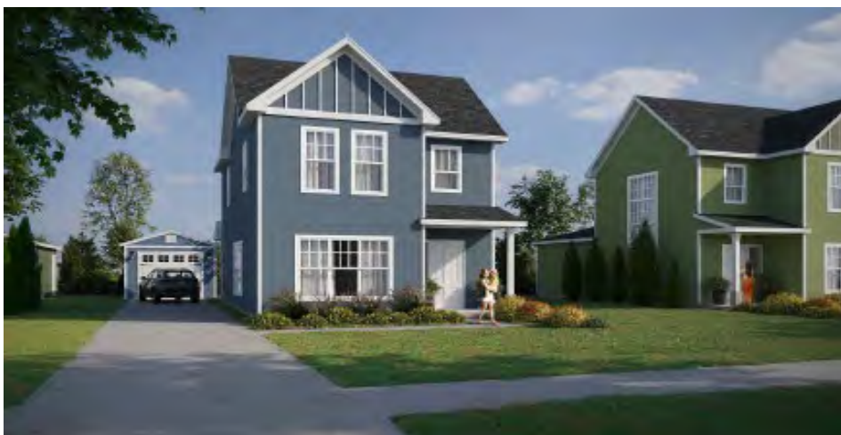
Royal Oak Cottages – 28 SF rentals