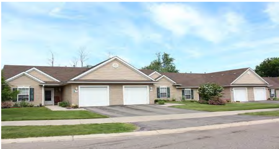
Oakland Woods – 216 senior units